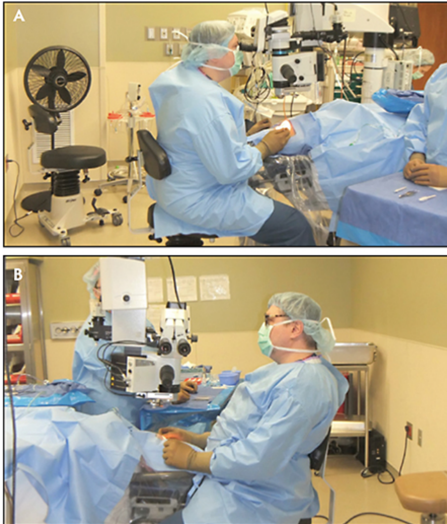
Figure 2. Typical vitreoretinal surgeon posture at the microscope. Note the neck craned forward to reach the microscope oculars and the complete absence of lumbar support (A). Typical vitreoretinal surgeon posture when operating using NGENUITY. Note straight back, straight neck, and lumbar support (B).

completely change our ergonomics by eliminating the microscope oculars. Back and cervical-spine position becomes physiologic, and the surgeon can enjoy lumbar support throughout surgery ( Figure 2B ). Careful setup of the heads-up visualization system permits excellent monitor visualization without head tilting or turning. 5-8