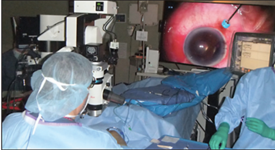
Figure 1. Current OR configuration for high-resolution 3D digital surgical viewing.

Tone reproduction (or luminance) is excellent with NGENUITY, which permits much lower lighting levels to be used from the light source. Typically, 20% to 30% of the light source intensity is used compared with analog viewing through the microscope. For us, light pipe intensity is reduced from 35% to the 5% to 20% range when operating with the Alcon Constellation and from 100% to 30% to 50% when using the Dutch Ophthalmic EVA machine. Moreover, reduced light exposure may be important in decreasing phototoxicity during more complicated cases, resident and fellow training, or macular peeling.