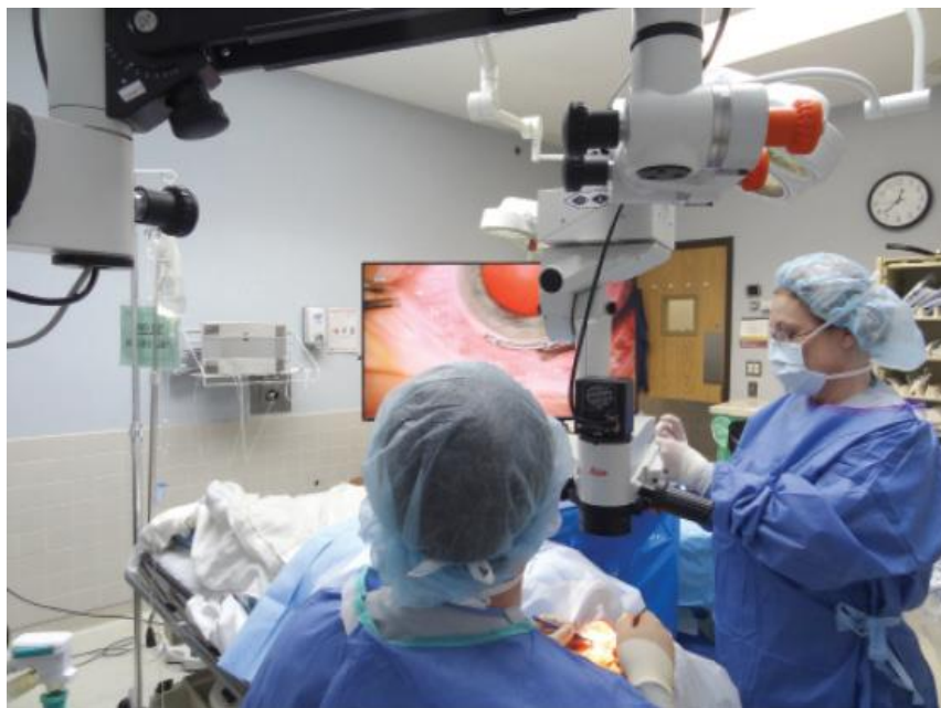
Figure 2. Heads-up 3-D cataract surgery.

The TrueGuide software was designed to automatically link the surgeon-specific SIA and astigmatic correction via a process called dynamic optimization, which allows for adjusting the location of incisions due to parameters such as the surgeon's seated position and customized incision range. Real-time vector analysis recommends a placement for an incision that predicts the least residual astigmatism for toric IOL and LRI positioning (Figure 1).